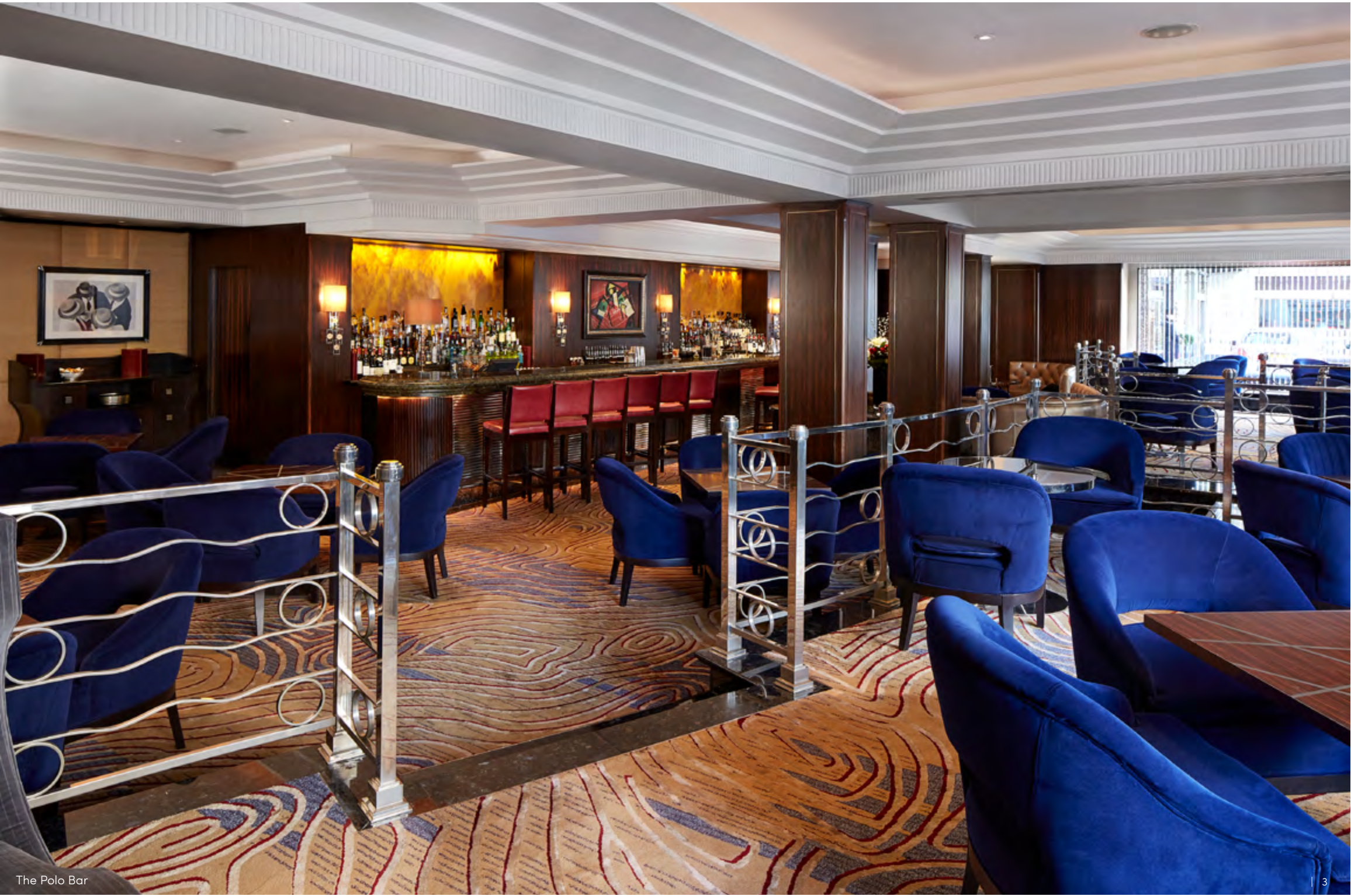
The Polo Bar