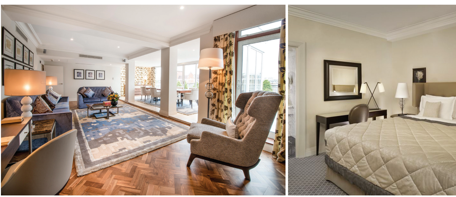
ST. GEORGE'S PENTHOUSE

The intimate 20 seater Tsukiji sushi restaurant is a perfect fusion of Japanese cuisine and Mayfair spirit offering exquisite sushi and sashimi dishes.